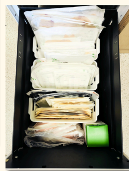
Drawer 3: Mepilex Boarder and Surgical Wound Management Products