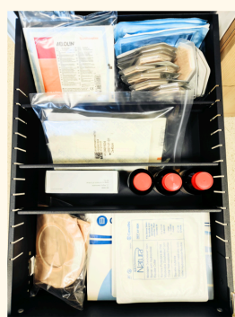
Drawer 2: Stoma Appliances and Special Wound Management Products