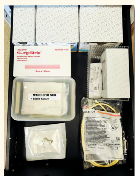
Drawer 1: Sutures, Sterile Strip, Ribbon Gauze